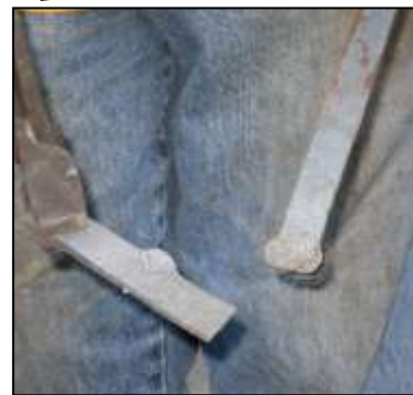
Scarfig for T weld done on the corners of the anvil