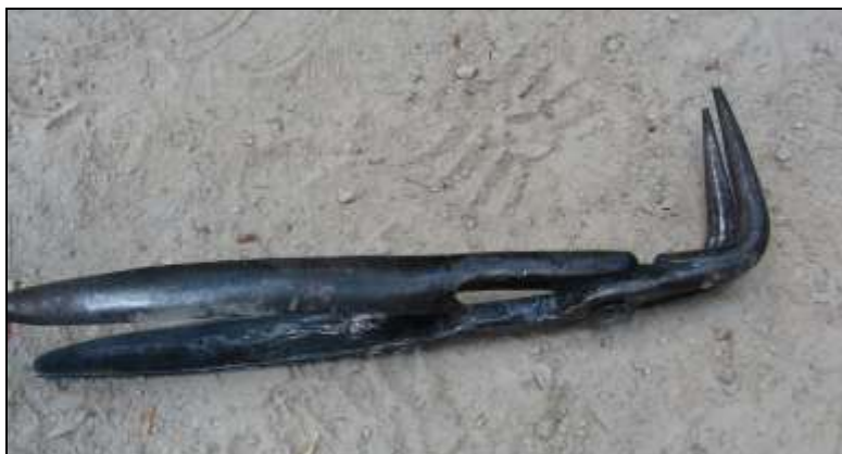
Above: adjusting the rivet