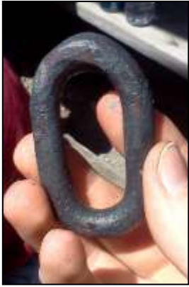
chain link welded from straight round stock