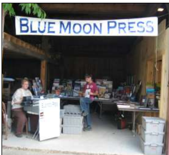
Blue Moon Press was at our Conference selling an assortment of metalsmithing books