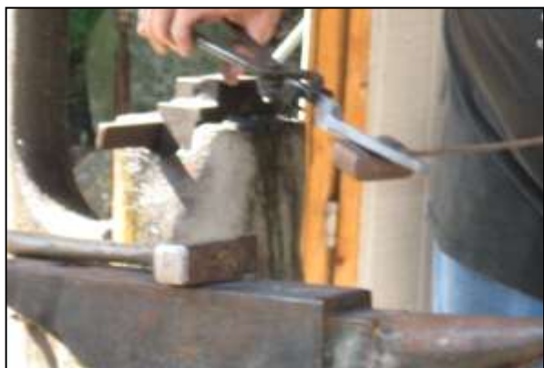
Bob Patrick forging scrolling tongs. They start like normal tongs, but with a square tapered end (top right) then rounded (bottom right). The handles are half rounded in a die (top left)