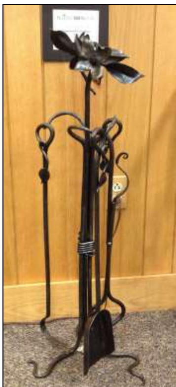
Dogwood Fireplace Set by Pat Livengood