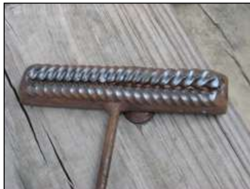
This simple tool has twisted bar welded onto a flat bar with handle. It makes the pattern visible in the picture bellow of the roughly finished trivet Bob Patrick demoed at the Conference