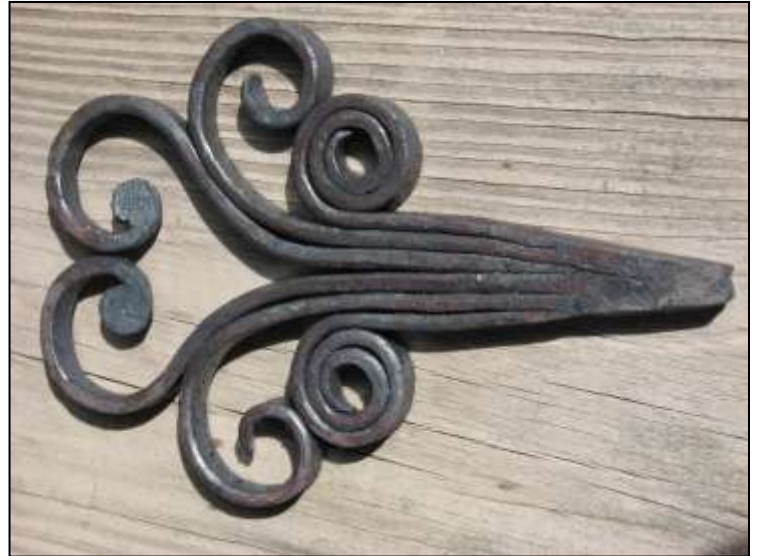
Trivet with forge welded end. The scroll ends are started before forge welding and scrolled after