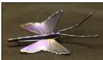
Pink Butterfly Pin by Jeff Hise