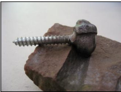
A screw welded onto an acorn to hide joinery