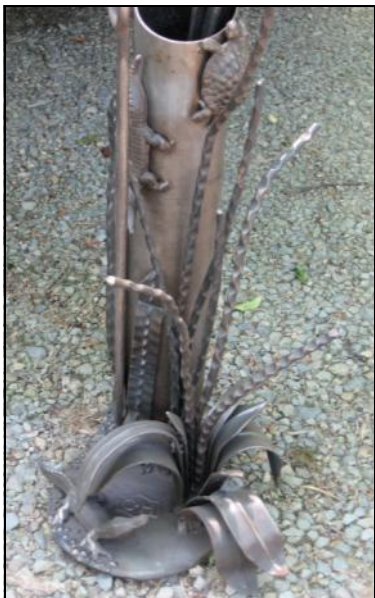
Umbrella holder with animals by Charles Hughes