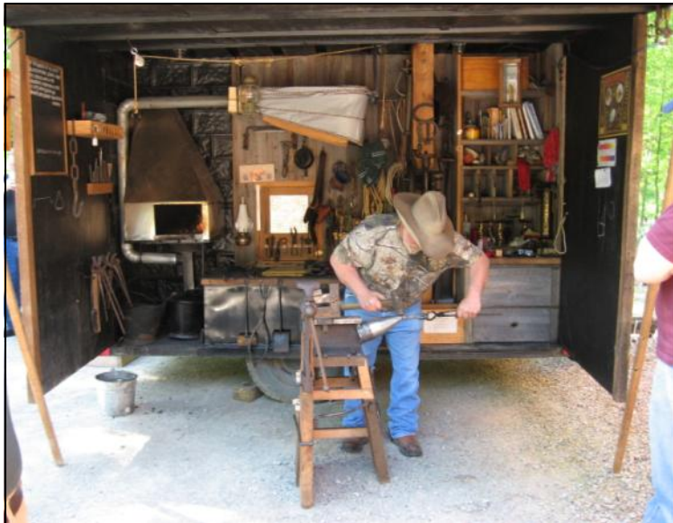
A small steam whistle here is powered by a hidden air compressor that is in turn powered as the hand-cranked drill press is worked