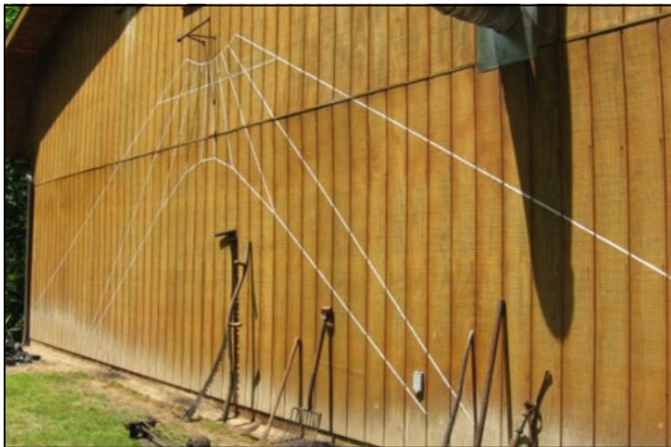
Sundial on the side of Brad Weber's shop accurate to the minute and approximate date