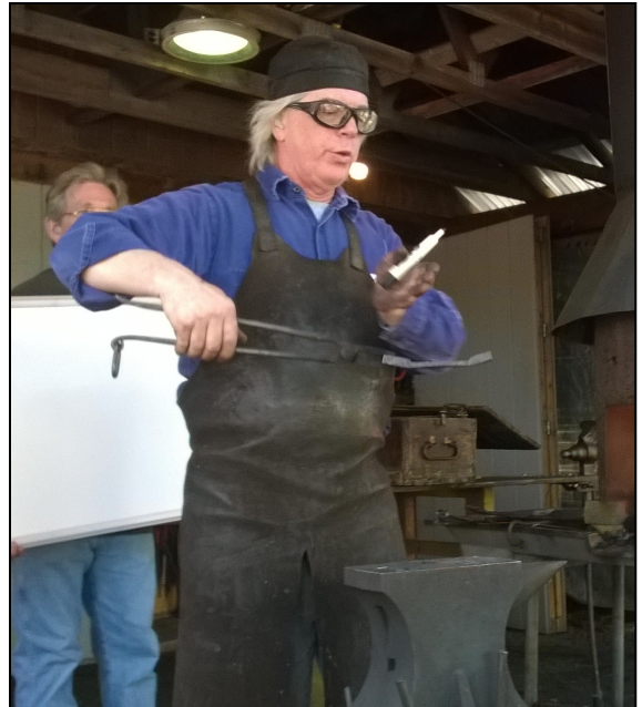
Jymm Hoffman's reproduction colonial-style anvil