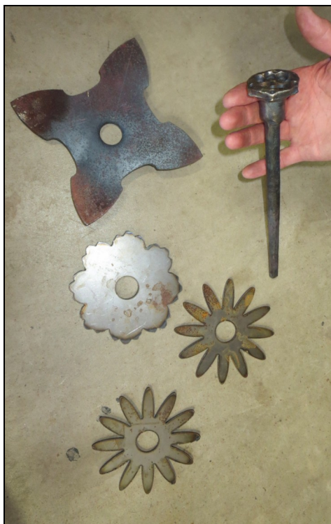
The layers to the flower demonstrated by Charles Hughes