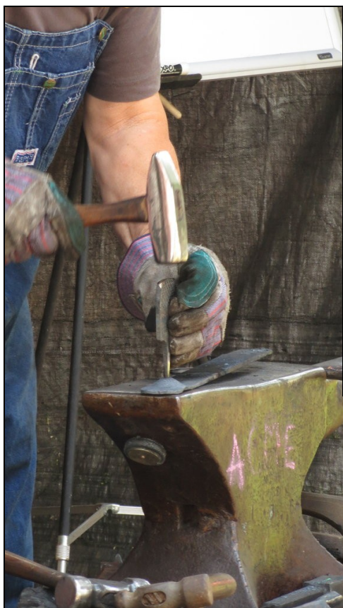
A simple way to make a nail header from a rasp. The tang of the rasp is drawn out for nail size desired. The tang end of the rasp is cut off to provide the punch for the header after the other side of the rasp has been domed